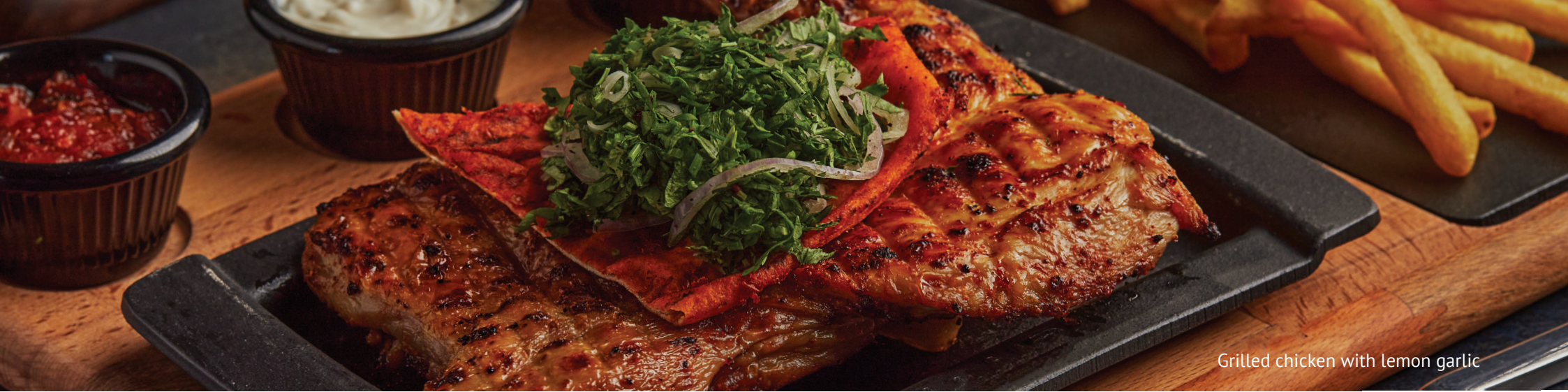
Grilled chicken with lemon garlic